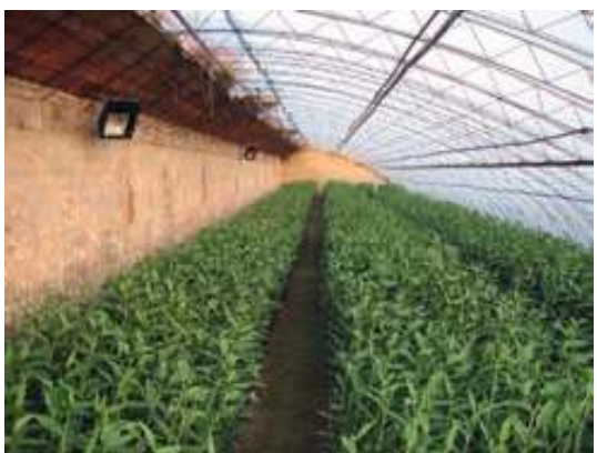
Different Greenhouse facilities