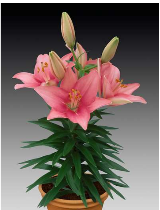
Asiatic hybrid, pot type