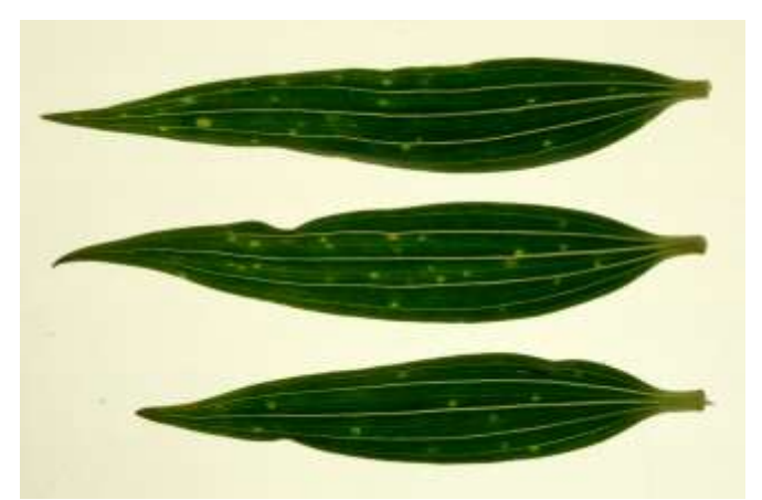
Leaves damaged by thrips

The eggs are deposited only by the Western Flower Thrip (Frankliniella occidentalis) that can enter the greenhouse after the mowing of grass or the clearing out of crops infested with thrips in nearby greenhouses.