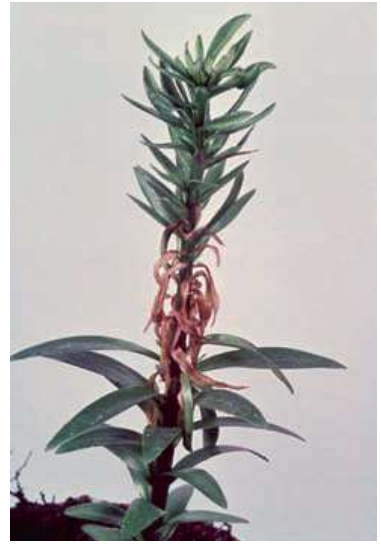
Symptoms in the middle of the stem

These symptoms are caused by Aphelenchoides fragariae (the strawberry leaf nematode) and Aphelenchoides ritzemabosi (the chrysanthemum leaf nematode). Leaf nematodes depend on temperature and moisture for their development. In uncultivated soil that is also fairly free of weeds, nematodes can survive for only 4-6 weeks. Their transference to the crop grown in the following cultivation period occurs by means of infested bulbs, weeds and/or crop residues from a preceding crop. These leaf nematodes have more than 600 host plants that include many weeds, perennials and other agricultural and horticultural crops.