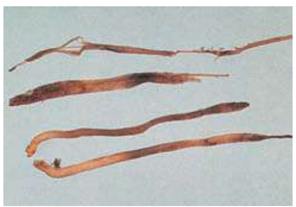
By Phytium infected roots

When plants are infested by Pythium, they are found scattered through the crop of in patches. They develop poorly, remain shorter and their bottom leaves turn yellow. The upper leaves are narrower, drabber in colour, and droop somewhat, particularly during periods of heavy transpiration. Infested plants display more bud desiccation and, in the winter, more bud drop. The flowers often remain smaller, frequently fail to open entirely, or fail to colour properly. When removed from the soil, the bulb and stem roots display glassy, light brown and rotting spots or are entirely soft and rotted all the way through. The only thing left is an empty membrane-like shell that can easily be detached from the core.