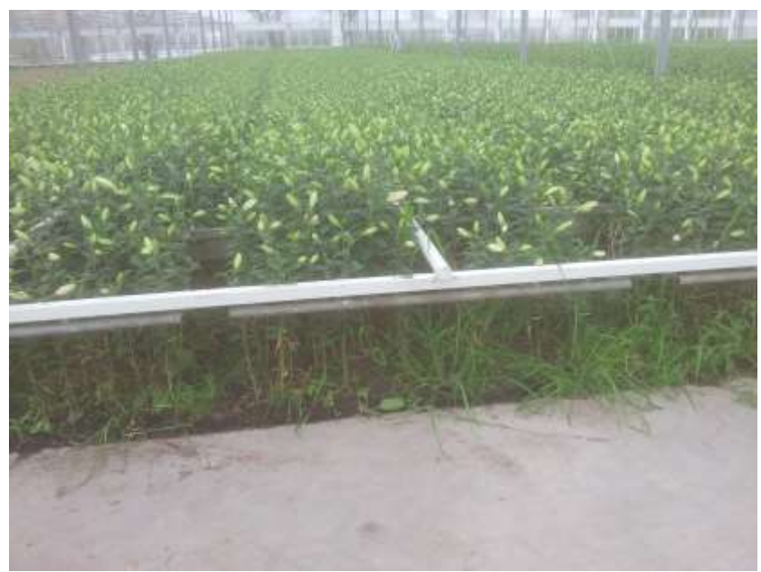
weed control important!

The best way to control weeds after planting is by weeding. A lily crop is extremely vulnerable and, depending on other conditions, can be quickly damaged by a post-emergence application of a chemical control agent. Be extremely careful in applying chemical weed control agents. If in doubt, conduct a test by spraying on a small surface to see how the lily plants react. Use chemical weed control only when really necessary.