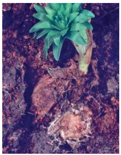
Leave infection caused by Rhizoctania solani