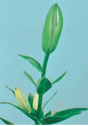
Bud abortion in an Asiatic hybrid

Flower bud desiccation can occur during any stage of development. If it occurs early, the plants will remain short and the leaves will be dull green, short and narrow and arranged closely next to the stem but will display no symptoms of leaf scorch. Some or all the flower buds will desiccate during an early stage of growth and will later appear in the axils of the top leaves as small white specks. If flower bud abortion occurs later in the plant's development, the plants usually develop normally with a normal root system and with flower buds that are already clearly visible. Later, however, the buds will turn light green and shrivel. Flower buds that have already begun to display their flower colour will turn paler and dry up completely but will usually not fall off. The upper buds in the inflorescence will be the first to desiccate.