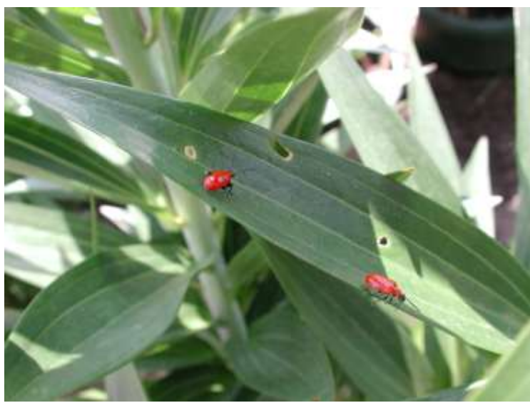
Lily Beetle on leaf

The Lily beetle (Lilioceris lilii) often devours a leaf right down to the stem. Flower buds can be damaged as well. The Lily beetle feeds on the leaves starting at the leaf margins. Adult beetles are 8 mm in length and conspicuous due to their bright red colour. The damaged leaves look ugly because they are covered with a thick, dark brown layer of slimy deposits.