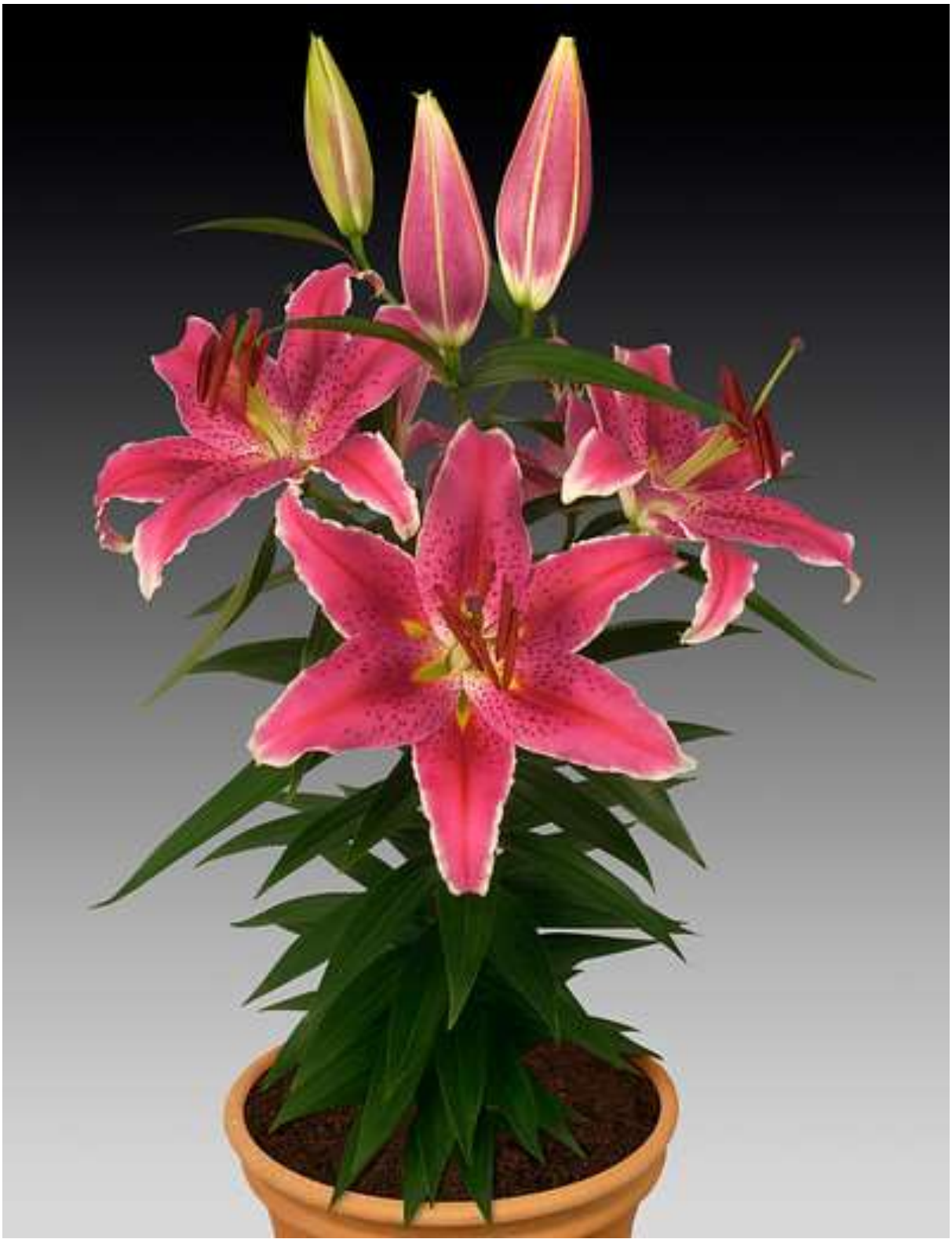
Oriental hybrid, pot type