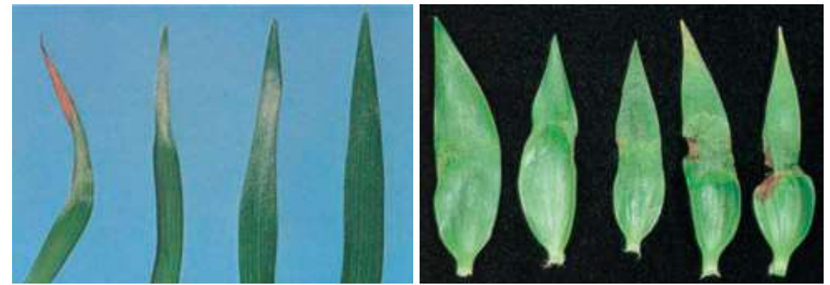
Leaf sorch in Asiatic hybrids

In a light case of leaf scorch, the plant will continue to grow normally and the damage will appear only on leaves located at a certain height on the stem. If the leaf scorch is more severe, the white spots can turn brown in places, and the leaf will curl at the damaged location. Young flower buds will be destroyed so that the plants will not continue to develop. In very severe cases all leaves plus the tender young buds will be lost Plants will then fail to develop further. This is known as 'top scorching'. In addition to the leaves, the stipules of the inflorescence can be scorched. (Sometimes, this happens only to the stipules). When this occurs, the top of the plant grows very crookedly or turns blackish brown. This can also happen to the mesophyll on the top of the petals so that the flower bud grows irregularly and displays openings on the top.